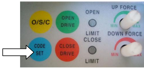
Fig1. GDO2,GDO4 garage door control panel

(To avoid same code with others, you can randomly set the coding of the new remote first.)