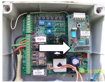
fig2. Gate control board